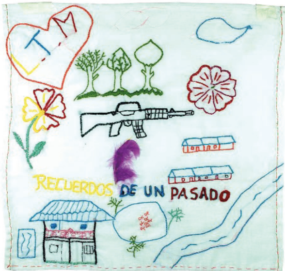
Figure 5. 'Gun', by Adriana, San José de León, Mutatá, Antioquia, 2019.

Flicking through the pages of the textile books, two further observations regarding textiles as a particular form of narrative stand out for me: