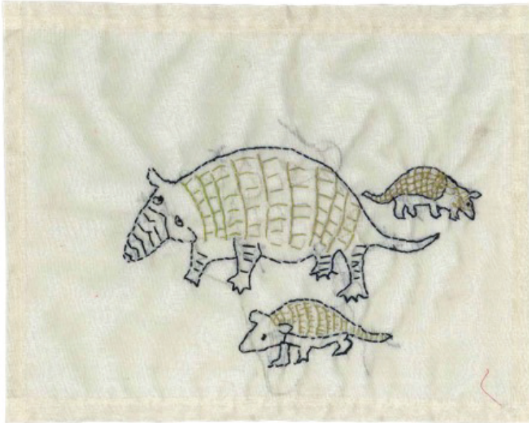
Figure 4. ‘Armadillos without claws’, by Luis Carlos, Llano Grande, Dabeiba, Antioquia, 2019.

symbolised in his textile by armadillos without claws ( Figure 4 ): ‘Like a little animal that has its claws removed and must dig with its injured fingers. They can’t make their houses or look for their food, and all they do is roam and roam. That happens to the armadillos when they don’t have their fingernails, and that is what happened to the peasants and hopefully it doesn’t happen to these FARC folks ( muchachos de las FARC ) as well’ (Arias López et al., 2020a, p. 154).