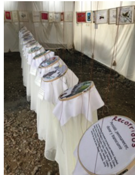
Figures 6 and 7. Exhibition (Des)tejiendo miradas [(Un-)stitching gazes], San José de León, Mutatá, Antioquia, 30 September – 5 October 2019.