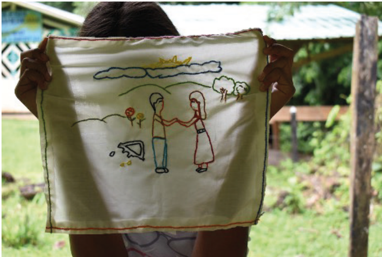
Figure 3. ‘Shaking hands’, by Marleida, San José de León, Mutatá, Antioquia, 2019.

2020). Yet, while most of these cooperatives see their productive projects also as a form of socio-political communication and action, incentivising such economic activity was not an objective of our research. More ironically and worryingly, our project – funded under a joint UK-Colombian research council call on “reconciliation” – has taken place in an ever more violent context, in which large numbers of social, indigenous and Afro-Colombian leaders, former combatants and politically active young people are killed by paramilitary and criminal armed groups, whose actions are tolerated by the state (Indepaz, 2020; López Morales, 2020).