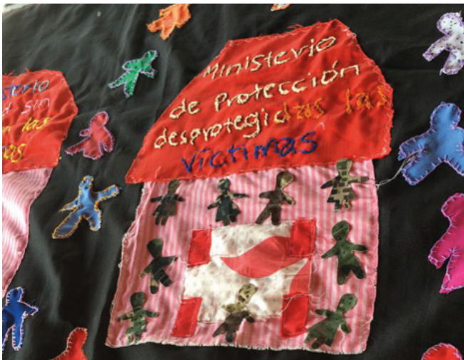
Figure 1. A textile created by people who identify as victims of the Colombian armed conflict. It reads ‘Ministry of Protection – the victims unprotected’, referring to the disjunction between institutional promises and the reality of the experiences of people who identify as victims during the Colombian transition. The textile was displayed by representatives of the Costurero de memoria at the workshop Roxani observed in Meta.

particular day in the transition zone in 2017, the textiles that people who identify as victims had created were laid out on tables as examples and sources of inspiration ( Figure 1 ).